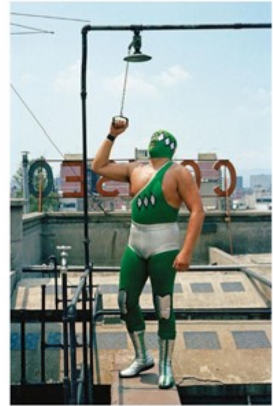
Cubrir su identidad. Eso es el principal objetivo de los luchadores que, desde la década de los 50, comenzaron a popularizarse en la lucha libre mexicana.