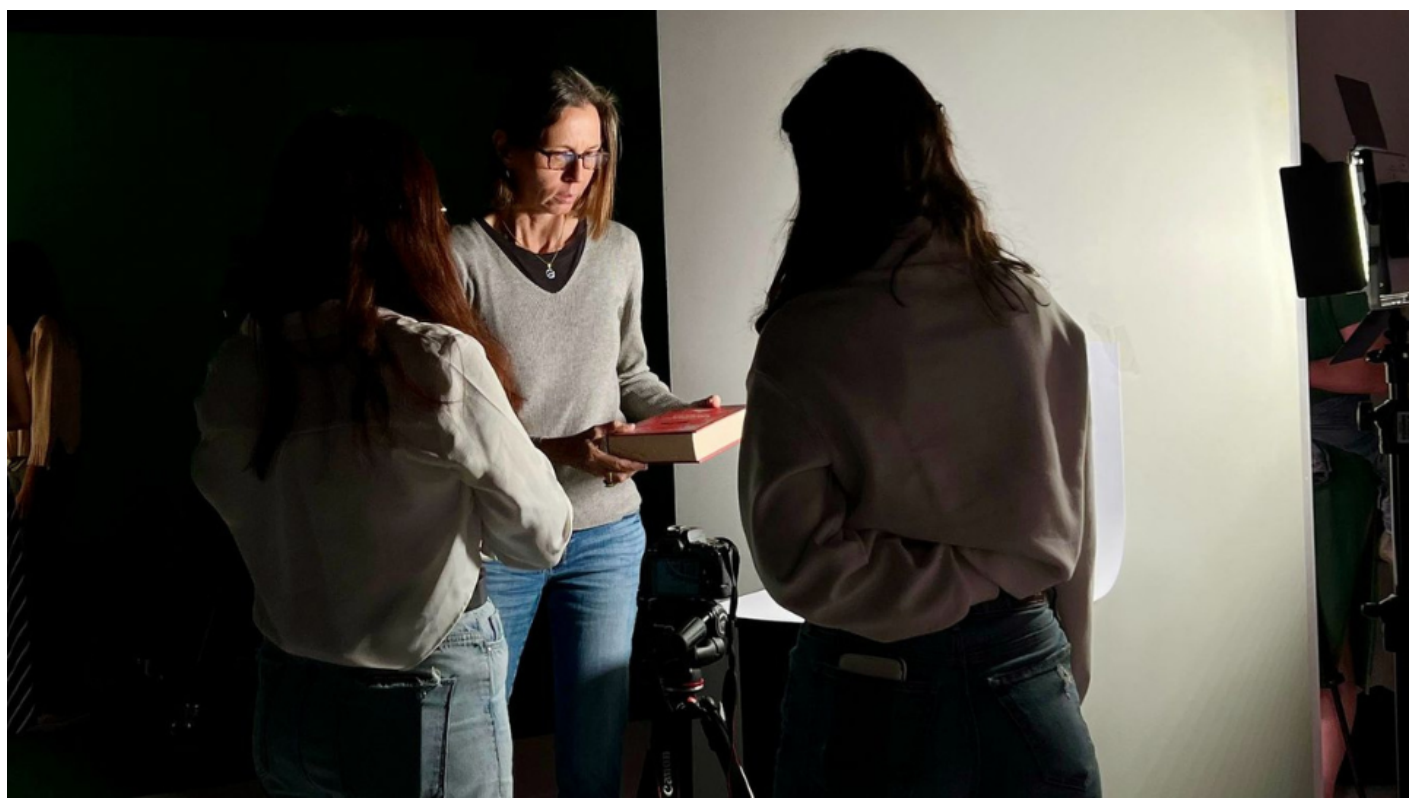
/> width="960" loading="lazy">

"I've been told I'm very passionate and that I'm able to convey that emotion to students. I don't just want them to learn theory, but to truly feel and understand photography," she said.