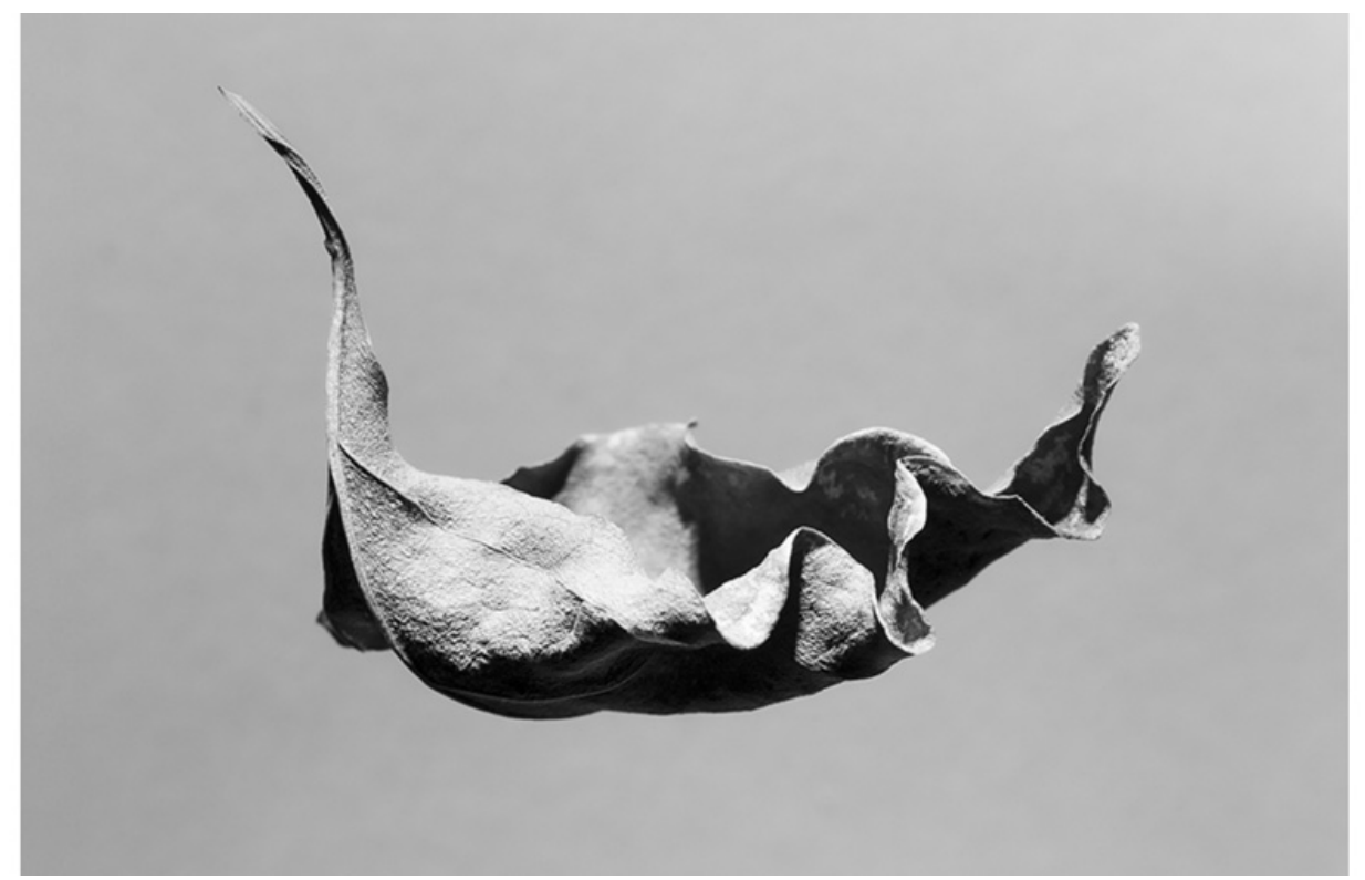
/> width="900" loading="lazy">