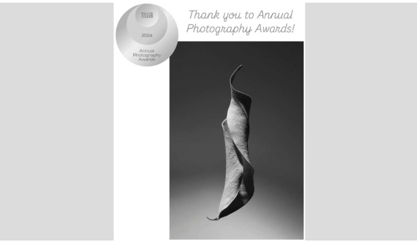
/> width="960" loading="lazy"> The origin of "Kalia"

The "Kalia" series, which means beauty in Greek, came about during the pandemic, a period in which the professor began to observe her surroundings more closely.