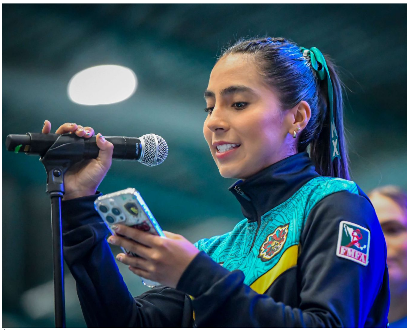
/> width="1350" loading="lazy">