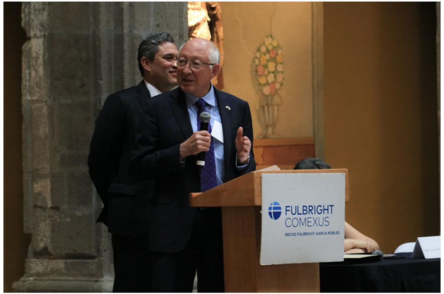
/> width="900" loading="lazy">