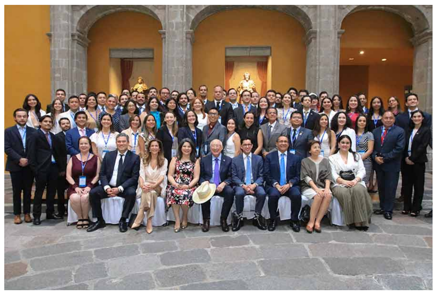
/> width="900" loading="lazy">

"Besides all the knowledge I will gain and the people I will interact with, what excites me the most is being able to represent my country."