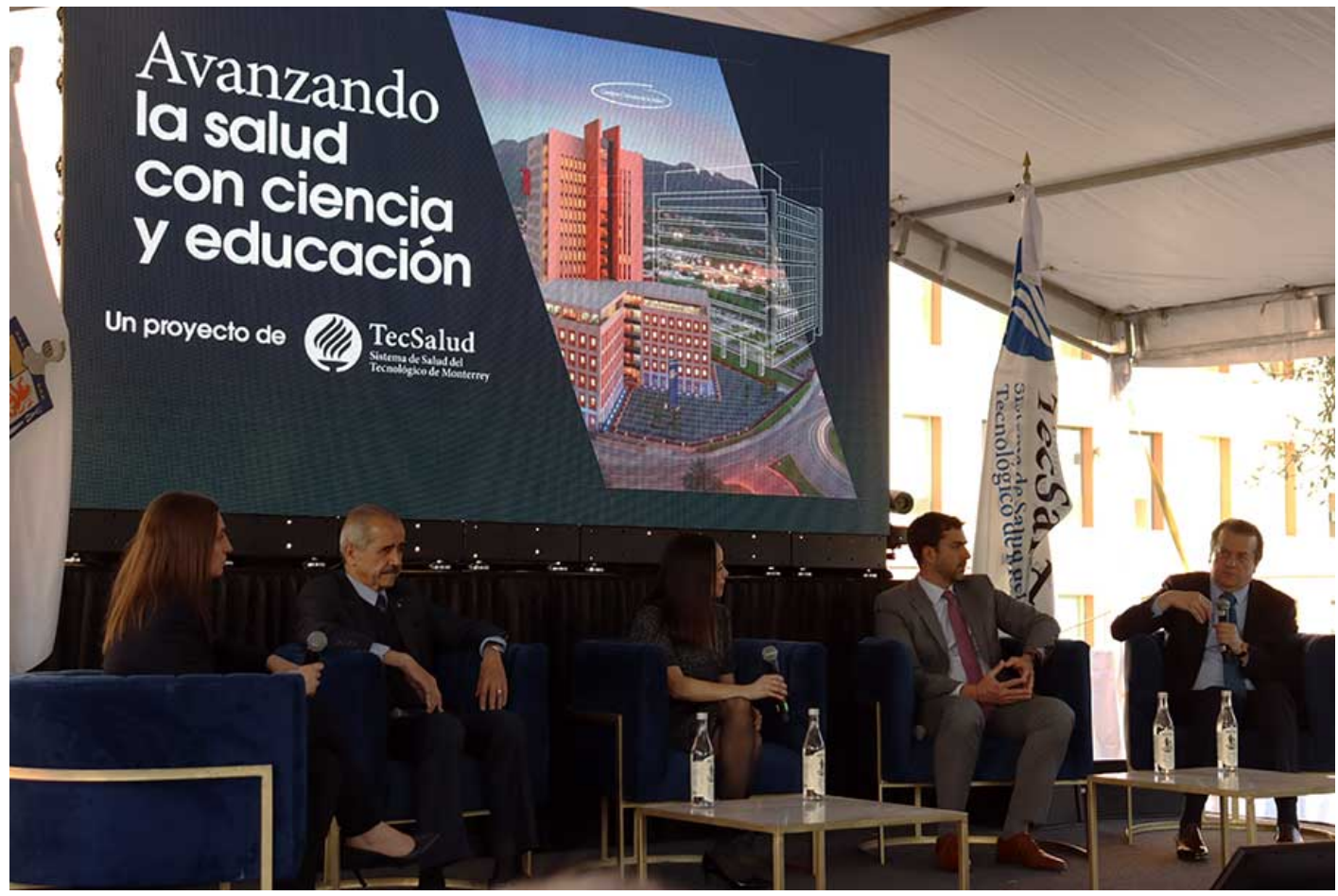
/> width="900" loading="lazy">