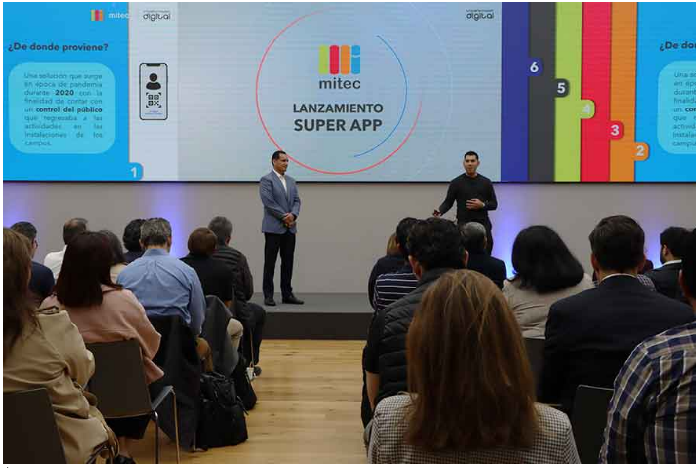
/> width="900" loading="lazy">

Mitec has evolved into the SuperApp MiTecApp platform and now offers an easy-to-use and accessible mobile experience.