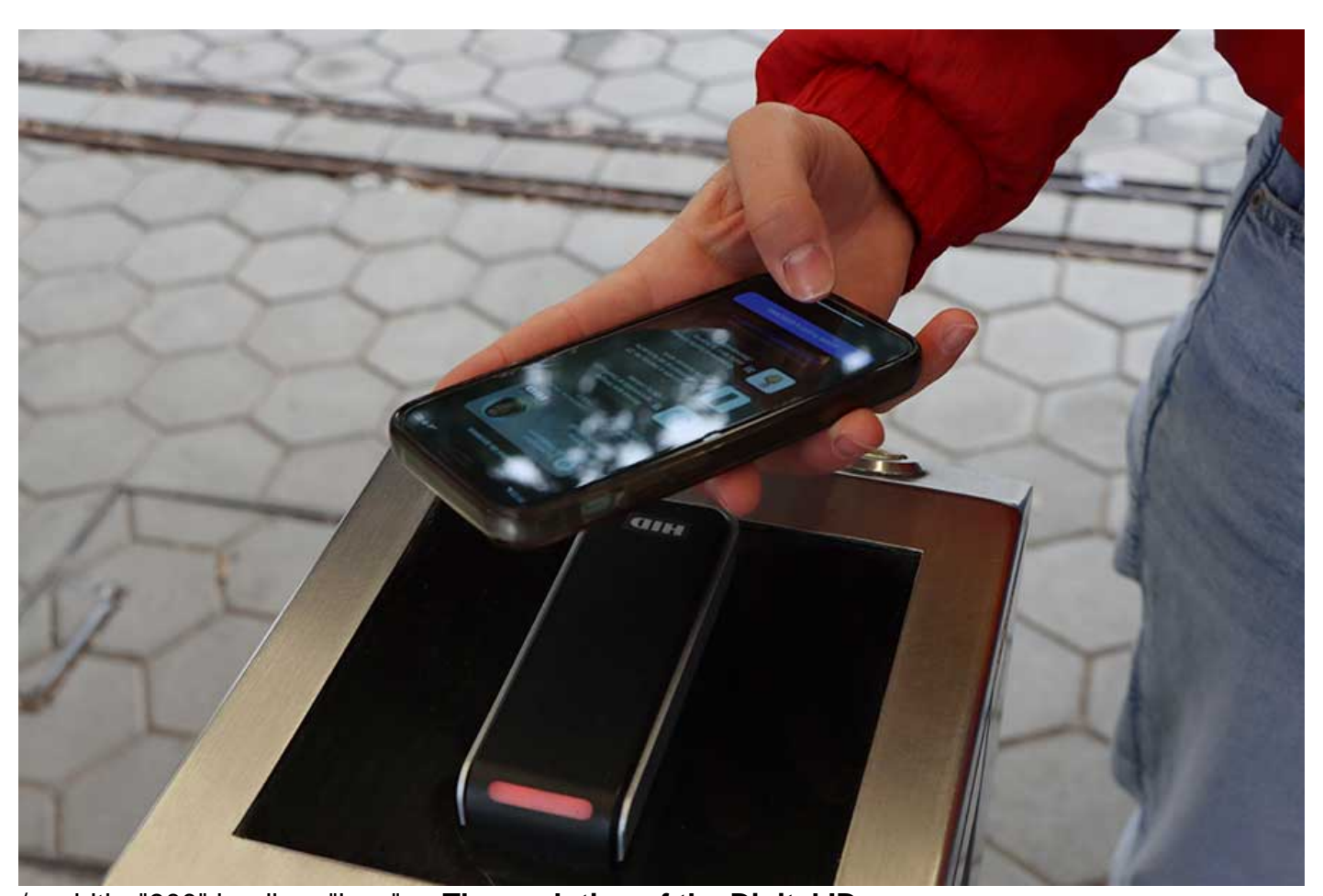
/> width="900" loading="lazy"> The evolution of the Digital ID

One of the most important changes that can be seen in the SuperApp is the transformation of the Digital ID , starting with the simplification of the ID creation process, with it now being remote , immediate , and digital .