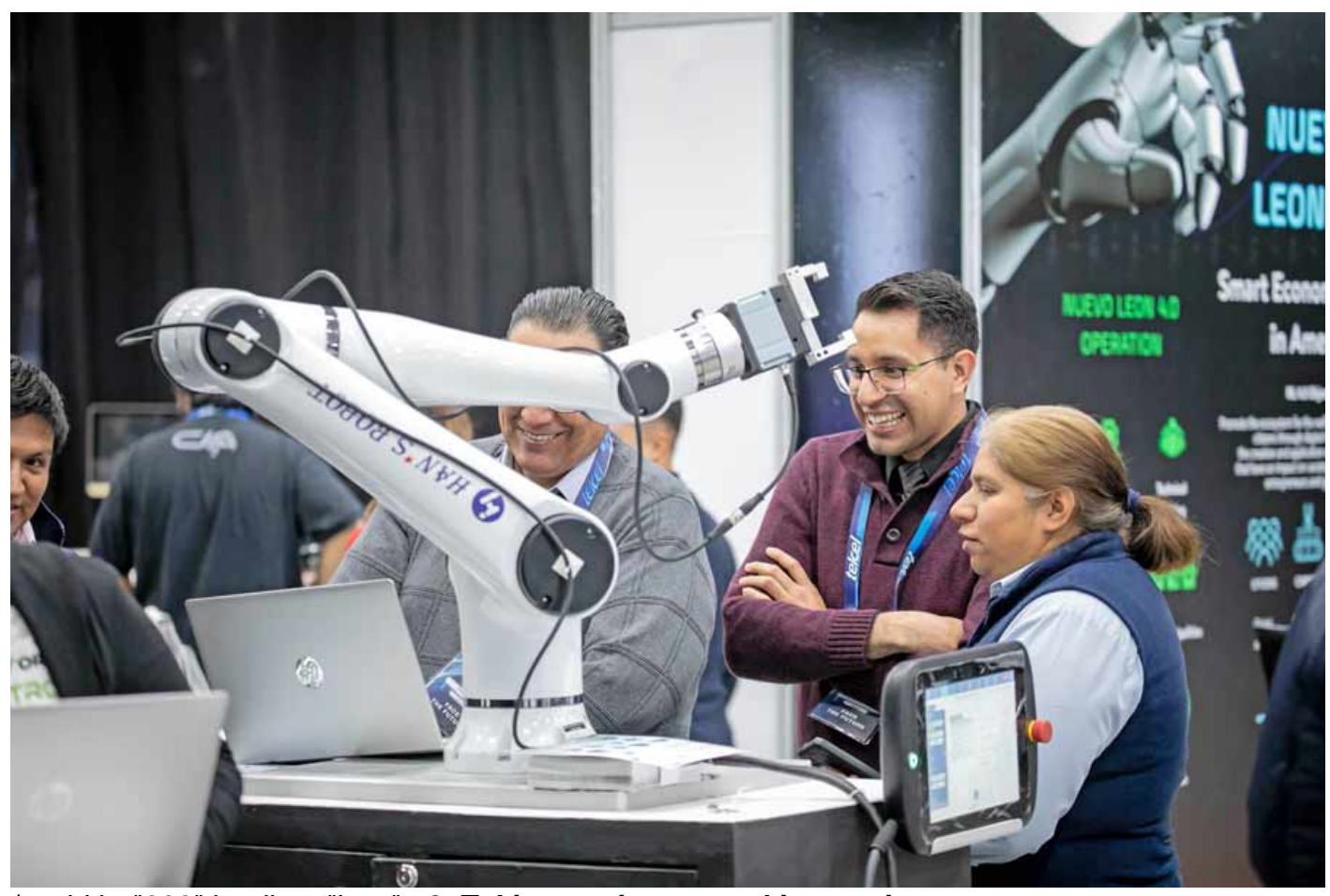
/> width="900" loading="lazy"> 9. Taking environmental impact into account

Visitors were also able to participate in the Future of Work Fair , which was held in conjunction with Nuevo León's Secretariat of Labor.