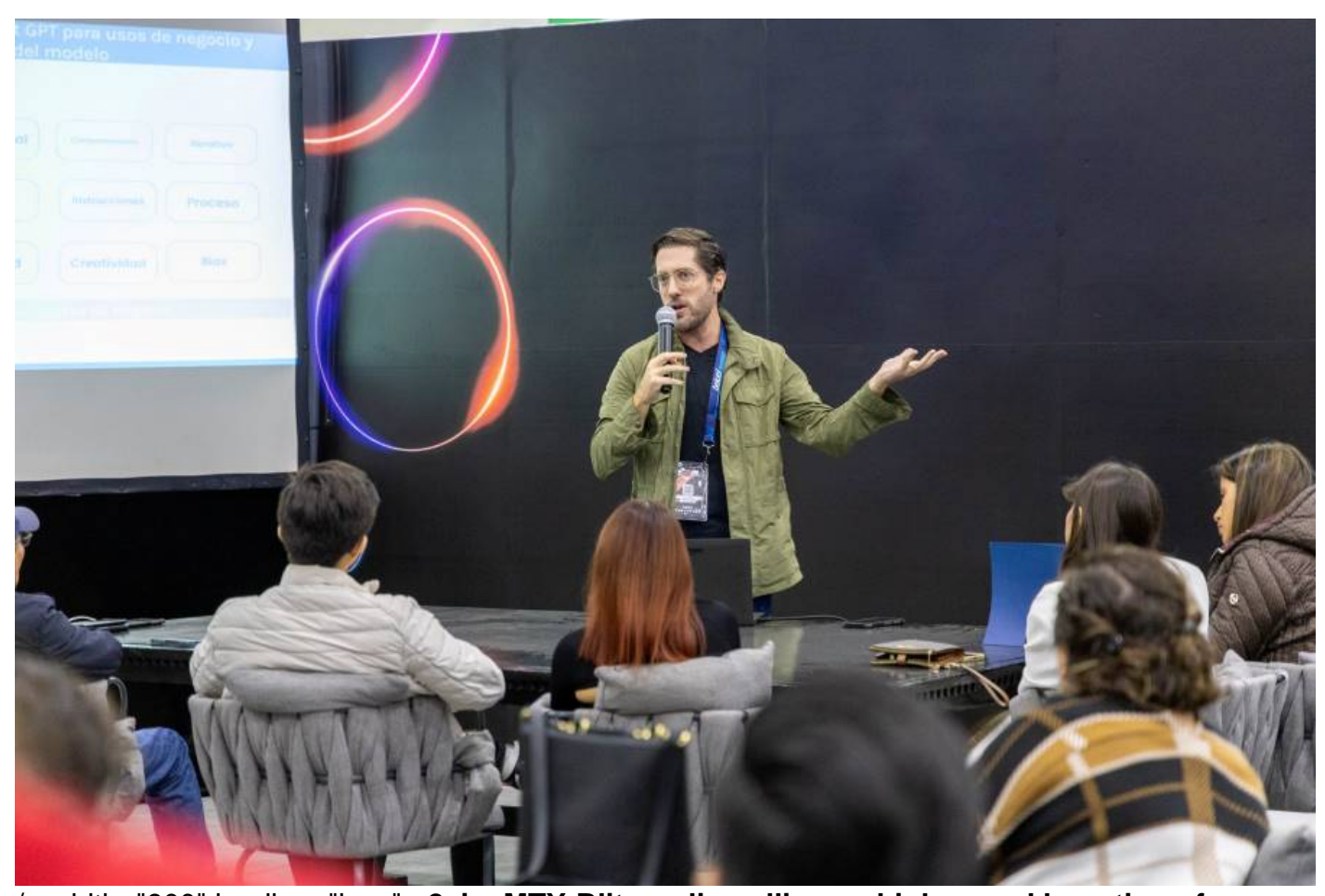
/> width="900" loading="lazy"> 2. incMTY-Blitzscaling alliance: high-speed boosting of startups

These speakers shared practical tips for the use of Al in large, small, and medium-sized companies.