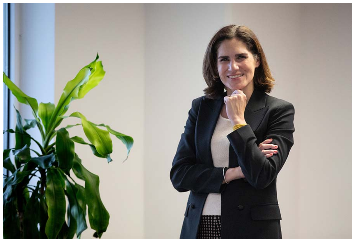
/> width="900" loading="lazy">