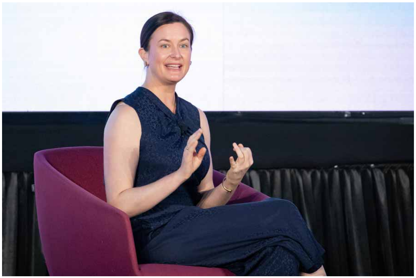
/> width="900" loading="lazy">