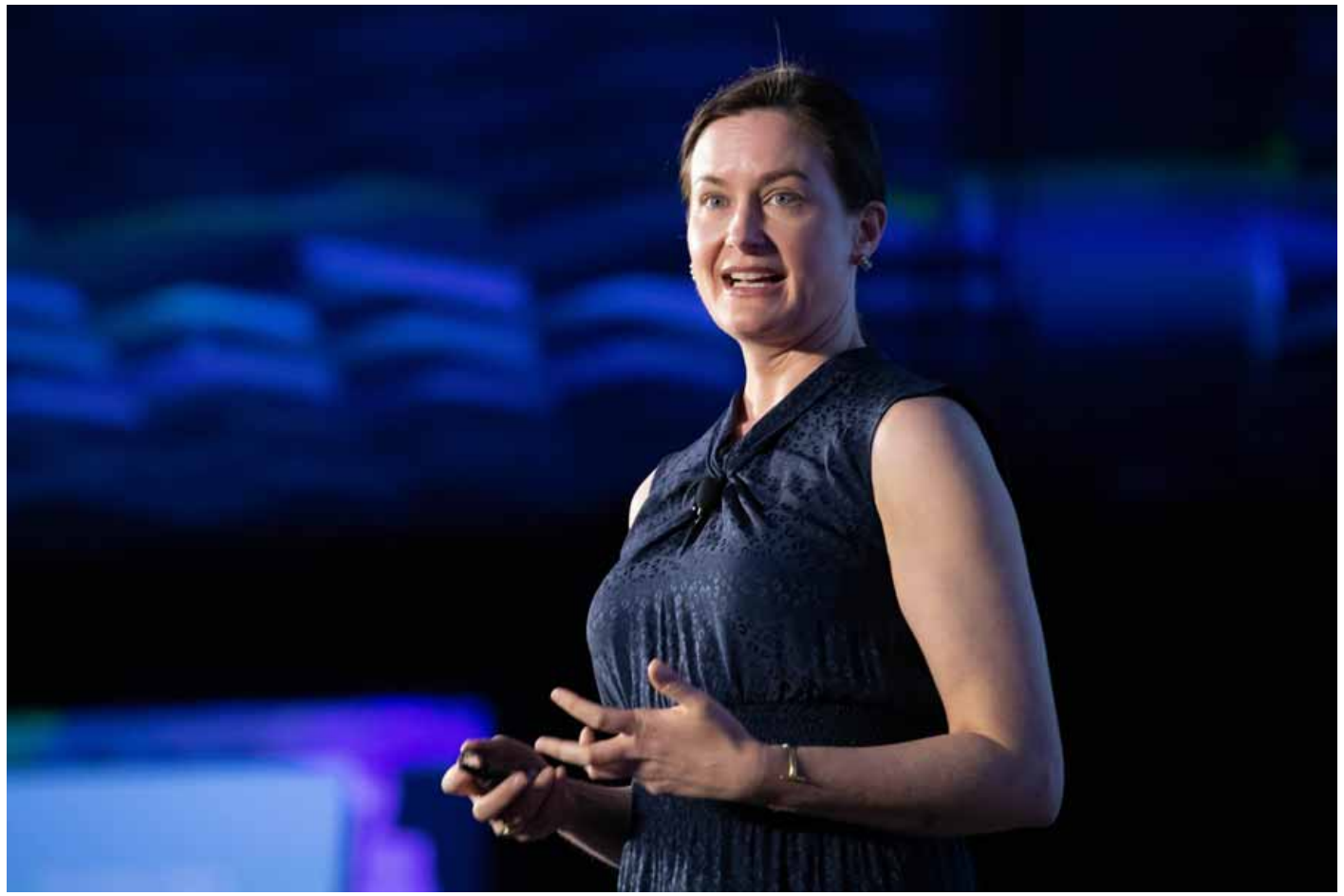
/> width="900" loading="lazy">

In an interview with CONECTA , the activist also spoke about three actions that universities such as the Tec can focus on.