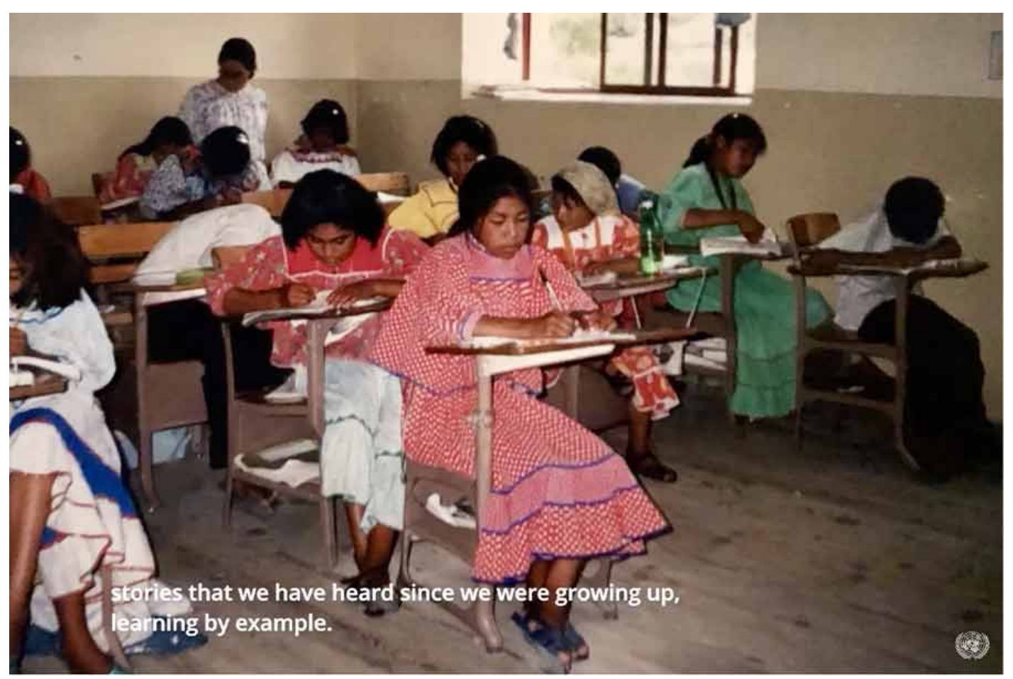
/> width="900" loading="lazy">

"With these types of missions, as I call them, we aim to get more people to join so every day we can achieve more," she says.