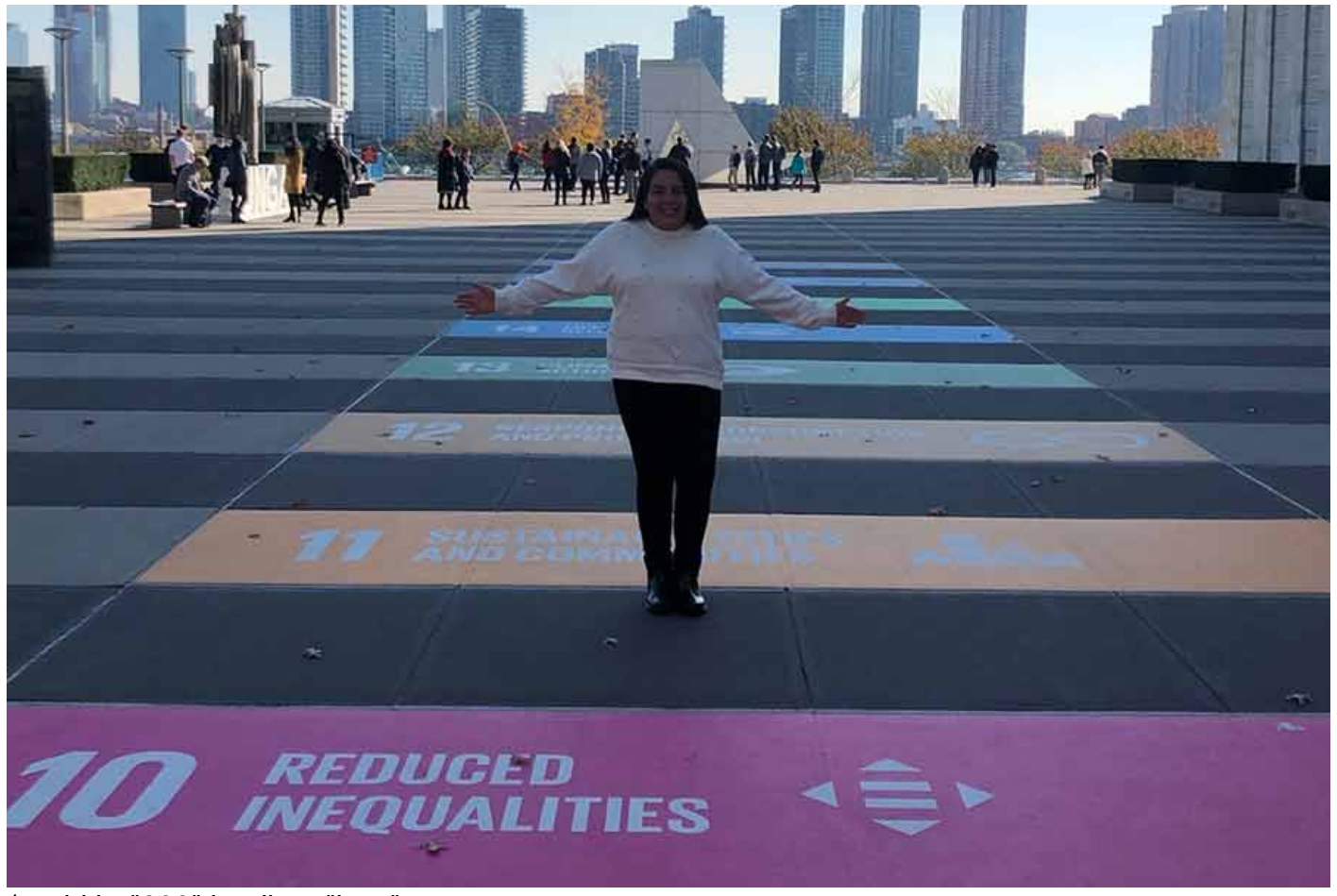
/> width="900" loading="lazy">

This student also believes that commitment to the SDGs must start from education and be complemented with initiatives for young people such as this contest.