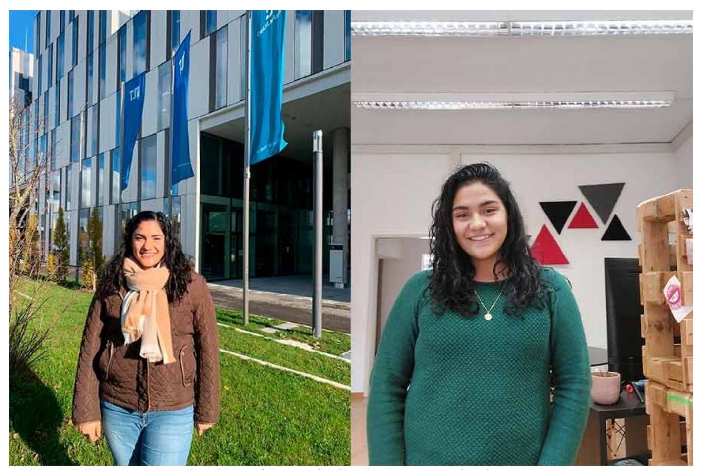
width="900" loading="lazy"> "We either paid for the house or for food"

"The most valuable thing (...) is that there are people who still believe in dreams. When you ask for support, they believe in your ability to achieve."